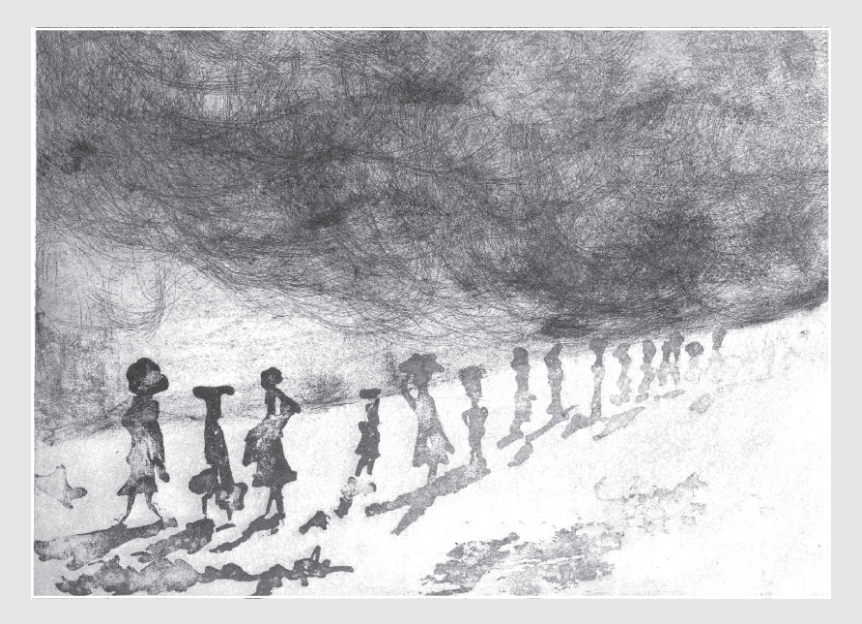
Wakimbizi Etching, 2003

I wasn't sure that I was in the right place, until the first night in Lugufu camp, when the pumping drum rhythms and blood-stirring guitar riffs of live Congolese soukous music hung in the air, heavy with smoke from the nearby bush fires. In what I would come to understand to be a daily ritual, the Lugufu Live Band played, its sounds reminding us of our humanity. We were not in any ordinary place of refuge. We were sad, we were hungry, we were guilty, we were angry, and we were all different—but we were alive and dancing.