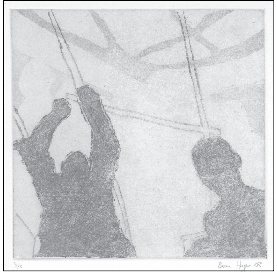
"Maendeleo" Etching, 2003

necessary during emergencies, providing aid in protracted cases seldom works to solve the root causes of displacement, there is an immediate need for a drastic change in the way food aid in general, and refugee food aid in particular, is carried out. The international refugee relief regimes must acknowledge the dilemma of providing for immediate welfare without considering a community's future welfare. Once the international refugee regime and the stakeholders worldwide reorient their conception of food aid and its effects to account more for the recipients of aid, assistance will prove a positive influence. People socialized in donor nations must understand the perspective of the recipient and should question whose interests the assistance is serving: those of the giver or those of the receiver. Jennifer Hyndman uses the term "colonialism of compassion" to describe the danger of humanitarian work, namely that it can function similarly to colonialism, despite a wealth of good intentions.